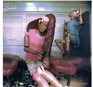
Unbelted passengers in a crash demonstration